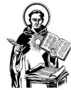
St Thomas Aquinas