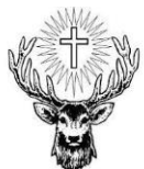
Saint Eustace pray for us