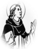
Saint Dominic pray for us