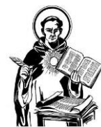
St Thomas Aquinas

This Advent we are called to ask ourselves how well we have accepted the message of Christ – what are we doing so people may rejoice and be glad?