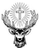
Saint Eustace pray for us