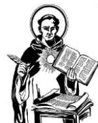
St Thomas Aquinas