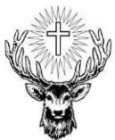
Saint Eustace pray for us

Divine Mercy, Rosary & Benediction First Sunday - 3pm