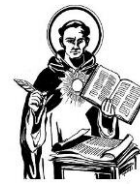
St Thomas Aquinas