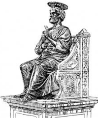
Chair of St Peter in St Peter's Basilica Rome.

The name "Pope" commonly used to refer to the Bishop of Rome come from the