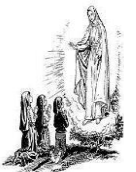
Pray for us now and at the hour of our death.

Eternal Rest grant unto them, O Lord, and let perpetual light shine upon them.